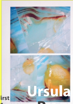
Ursula Ryan Photography: First Place Winner for "Reflected Lemons"