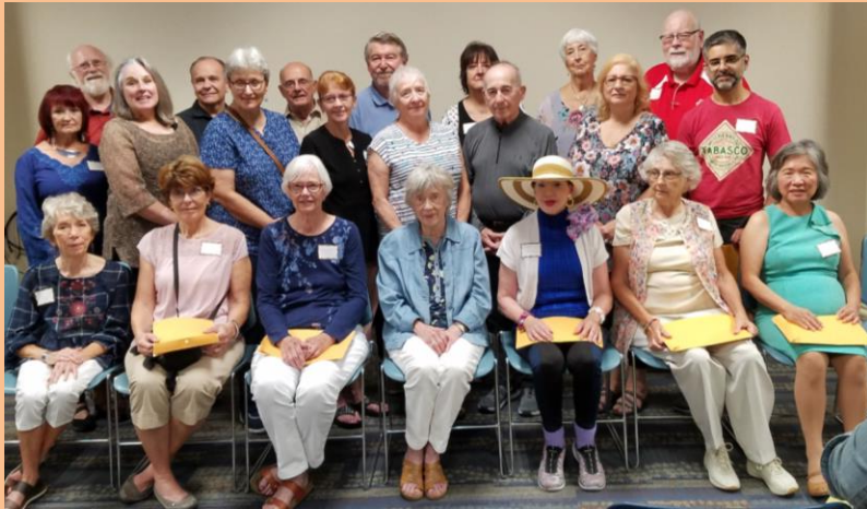
Some of the winning artists and artwork from the 2019 Community Of Fine Arts Show.